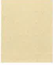
BM1053 Sierra Hill