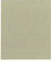
BM HC-107 Gethysburg Gray