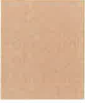
BM2164-40 Strength Sand