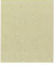
BM1523 Embodiment Green